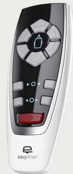
Easy operation with the stylish remote control.