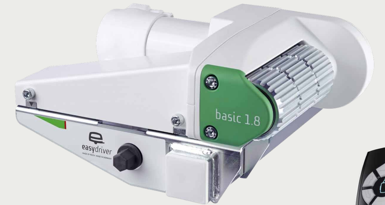
Easy to operate easydriver remote control.

Although the easydriver basic is our budget priced manoeuvring system it will not cost you when it comes to comfort and convenience. It is simply great for vehicles of all sizes. Manual engagement of the rollers with cross actuation as standard.